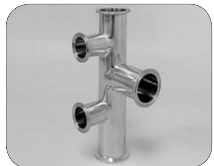
CUSTOM TEE ASSEMBLIES

From simple to complex, TOP LINE's Specialty Fabrication Shop can make the part you need. We pride ourselves on our superior craftsmanship and prompt service.