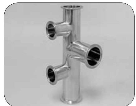
CUSTOM TEE ASSEMBLIES

From simple to complex, TOP LINE's Specialty Fabrication Shop can make the part you need. We pride ourselves on our superior craftsmanship and prompt service.